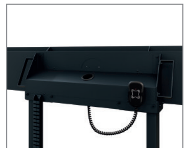
Cable management via cable drag chain